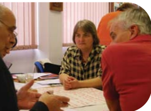
TLM Country Leaders met together at the TLM forum in London in June 2010