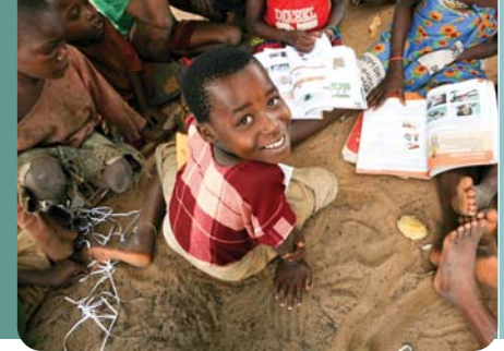
School children in Mozambique

'Learn to do right! Seek justice, encourage the oppressed. Defend the cause of the fatherless, plead the case of the widow,' Isaiah 1:17