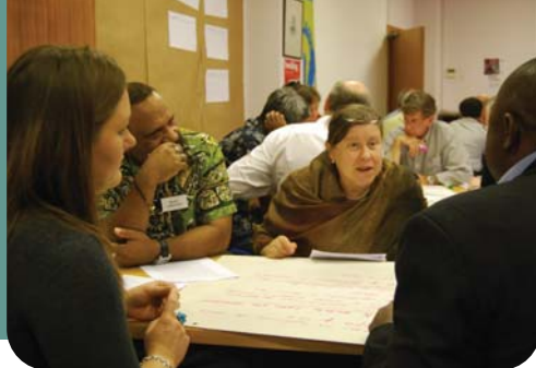
TLM Country Leaders met together at the TLM forum in London in June 2010

'May the God who gives endurance and encouragement give you a spirit of unity among yourselves as you follow Christ Jesus,' Romans 15:5