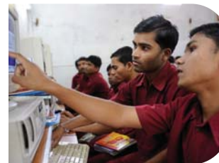
Students at TLM's Champa Vocational Training Centre in India

ABOUT 69 MILLION SCHOOL-AGE CHILDREN ARE NOT IN SCHOOL. ALMOST HALF OF THEM ARE IN SUB-SAHARAN AFRICA, AND MORE THAN A QUARTER ARE IN SOUTHERN ASIA