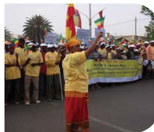
A World Leprosy Day march in Ethiopia