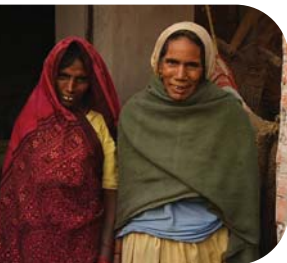
Recipients of a low-cost house in Barabanki, Uttar Pradesh

Stigma: Give thanks for the government organisations that use TLM's Hospital in Naini , Uttar Pradesh, as a referral centre for reconstructive surgery and leprosy complications. Pray that there would be greater understanding in the communities surrounding the hospital about the true nature of the disease, and that people will be free of all superstitions and stigma related to leprosy.