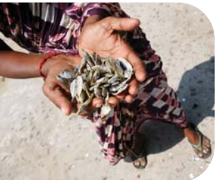
Drying fish to sell in Pondicherry, Tamil Nadu, India