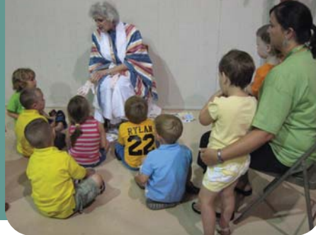
ALM: Vacation Bible School at Collins United Methodist Church, Mississippi, where the children were taught about leprosy

'And it will be said: "Build up, build up, prepare the road! Remove the obstacles out of the way of my people." For this is what the high and lofty One says – he who lives forever, whose name is holy: "I live in a high and holy place, but also with him who is contrite and lowly in spirit, to revive the spirit of the lowly and to revive the heart of the contrite," ' Isaiah 57:14-15