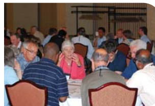
Discussion about Global Partnership at the 2009 International Assembly