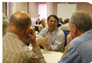
Country Leaders discussing Global Partnership at the TLM Forum in London 2010