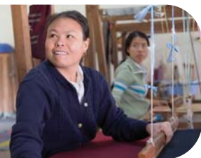
Poma has received training in weaving at Lao and now is able to support herself

FACTFILE ACCORDING TO WHO THERE ARE 60 MILLION KNOWN DISABLED PEOPLE IN CHINA