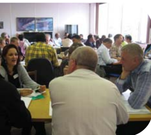
Strategy: The Implementing Country Leaders' forum, London, June 2009