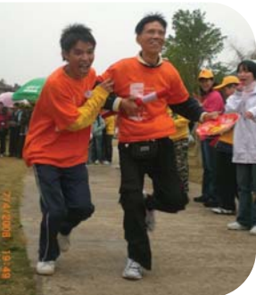
HANDA organises social activities for villagers