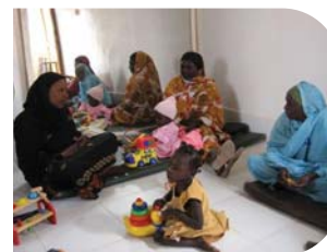
A mother and child group at Aburof Clinic, Sudan