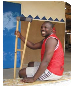
Support: A patient at CSL Danja Hospital, Niger

FACTFILE 49% OF THE POPULATION OF NIGER IS AGED 14 AND UNDER