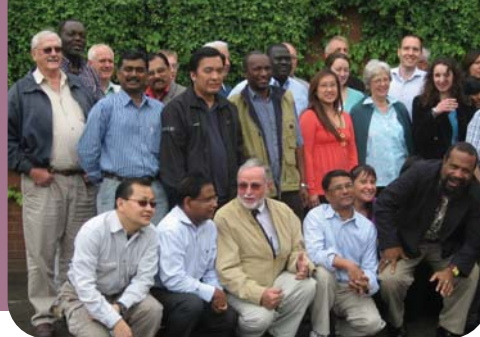
Team: Country leaders, international office staff and members of the global operations team

'But the plans of the Lord stand firm forever, the purposes of his heart through all generations,' Psalm 33:11