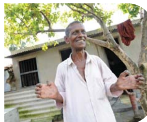
This man has benefited from a low-cost house

Integration: TLM India's Integrated Community Development Programme (ICDP) is made up of several core projects that seek to promote social integration and empower leprosy-affected people to live independently. Pray for God's strength for the communities benefiting from this programme, that they will become self-sustainable and self-reliant.