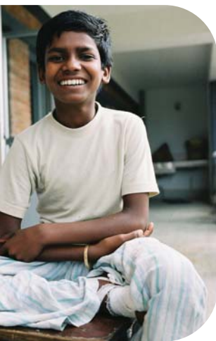
A young patient at Anadaban Hospital, Nepal

Travel: The community outreach teams from LLSC have