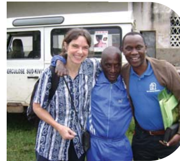
TLM staff in DR Congo with a beneficiary (centre)