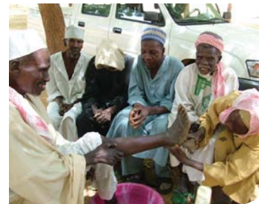
Checking for infections: a self-care group in Sokoto State

FACTFILE 70% OF THE POPULATION OF NIGERIA LIVE BELOW THE POVERTY LINE