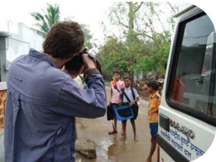
One of TLM's freelance photographers in action in Andhra Pradesh, India

Travel: Many TLM staff in DR Congo fly regularly because this is often the only way to reach remote parts of this vast country. Pray that the government will introduce stricter regulations on aircraft maintenance to reduce the high number of domestic plane crashes. And pray for God's continued protection on all staff working here.