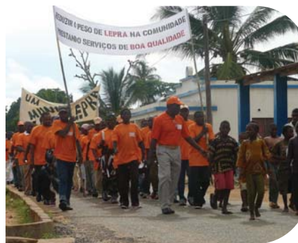
A World Leprosy Day march in Mozambique 2008

TLM Nigeria is continuing its promotional initiative across churches in Nigeria to recruit Christian supporters who will pray and donate finances. Pray for God's strength and wisdom for the team as they extend the recruitment outside Niger State and the Federal Capital Territory into Kogi and Kwara States.