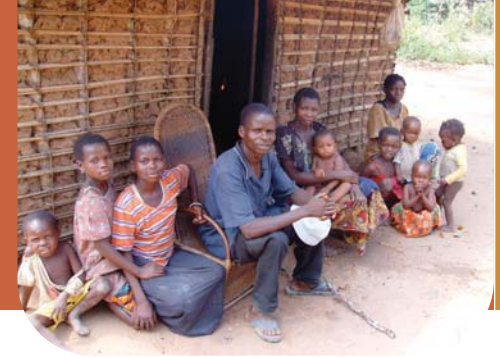
Family life in DR Congo

'Call to me and I will answer you and tell you great and unsearchable things you do not know.' Jeremiah 33:3