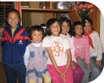
Children from the rehab villages in their dormitory at a good public school. The girl on the far right is the same girl in the photo on page 17

Income: Women at the Lao Disabled Women's Development Centre are trained in tailoring and card making. Sales of their products are growing both in Laos and around the world. Pray that staff will remain focused on the project's vision during this time of growth and increased interest in the work.