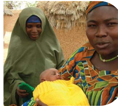
This baby, held by a local pastor's wife, is wearing a jumper knitted by TLM Australia supporters

FACTFILE 70% OF THE POPULATION OF NIGERIA LIVE BELOW THE POVERTY LINE