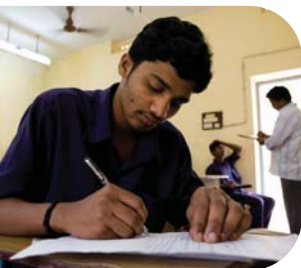
Above: A student at work at Vizianagaram Vocational Training Centre, India