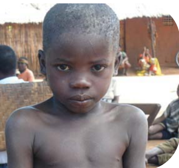
This child in Mozambique received help from a TLM partner

Resources: TLM aims to double the resources available for leprosy work between 2008 and 2012. Good progress is already being made but this goal is a real challenge for the smaller supporting countries, especially those who rely entirely on volunteers. Pray for clear vision and that new possibilities will be identified and grasped.