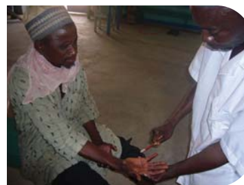
A nurse checks for sensation in a patient's hand at CSL Danja Hospital, Niger

FACTFILE ELECTIONS ARE DUE TO TAKE PLACE IN SUDAN BY JULY 2009 IN ACCORDANCE WITH THE TERMS OF THE 2005 PEACE AGREEMENT