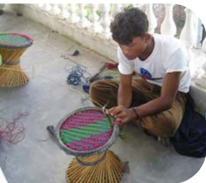
Making baskets to earn a living, Nepal

FACTFILE IN NEPAL THERE ARE APPROX 4,500 CASES OF LEPROSY CONFIRMED EACH YEAR AND MORE THAN 80% ARE DIAGNOSED IN THE SOUTHERN TERAI REGION