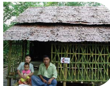
A new house for a family affected by Cyclone Nargis

FACTFILE OVER TWO MILLION PEOPLE WORK IN THE SEX INDUSTRY IN BANGKOK