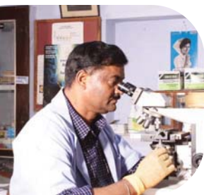
A laboratory technician at Barabanki Hospital, India

Positive results: Give thanks for the success of a number of research studies in TLM centres, including COLEP (a trial of preventative drugs which aims to protect close contacts of leprosy patients) carried out in Nilphamari, Bangladesh, and INFIR (a study of early nerve damage in leprosy) carried out in several centres in India.