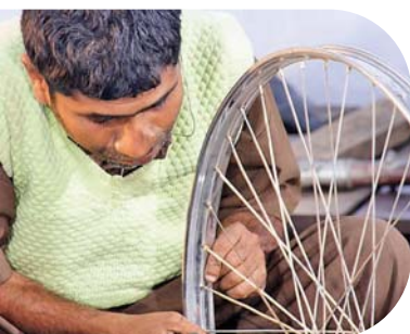
Learning to fix bikes at Bankura VTC