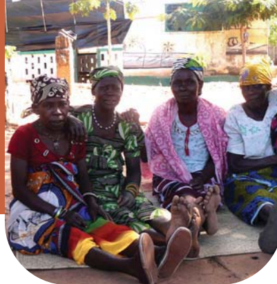
Members of ALEMO, Mozambique