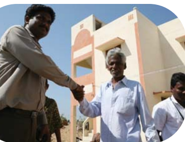
A CBR worker (left) with a man and his new low-cost house, Pondicherry