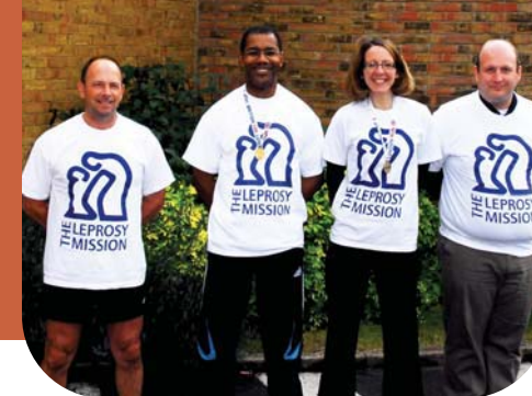
Some of the supporters who ran the London 10K to raise money for TLM in 2008

'Trust in the Lord with all your heart and do not rely on your own understanding,' Proverbs 3:5