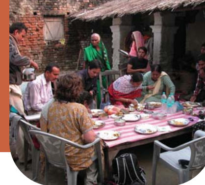
Sharing a meal: a group from New Zealand and staff in Nepal

'Yet this I call to mind and therefore I have hope. Because of the Lord's great love we are not consumed, for His compassions never fail. They are new every morning,' Lamentations 3:21-22