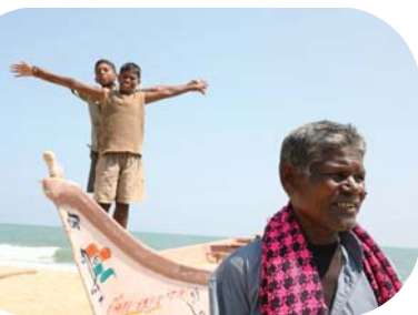
This man's family received a low-cost house in Pondicherry, Tamil Nadu

FACTFILE THE LITERACY RATE IN INDIA IS 61%