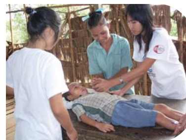
Pathein Rehab Centre, Myanmar

FACTFILE OVER TWO MILLION PEOPLE WORK IN THE SEX INDUSTRY IN BANGKOK