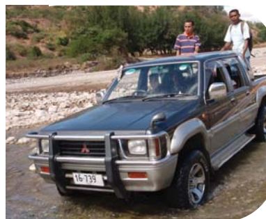
TLM Staff in Timor Leste travelling to remote villages