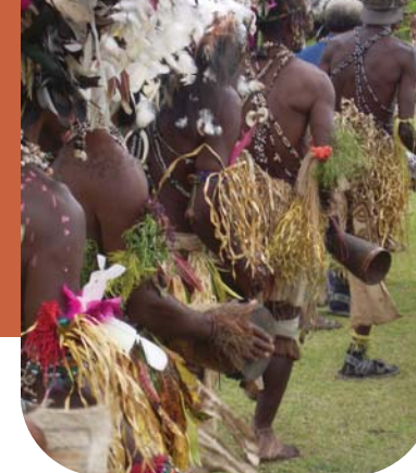
Tribal dancers in Papua New Guinea

'The Lord gives strength to his people; the Lord blesses his people with peace,' Psalm 29:11