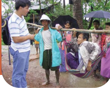
Myanmar after Cyclone Nargis, May 2008

India: Although the economy is growing fast, there are still some underlying political and religious tensions. Last year, several bomb blasts caused death and